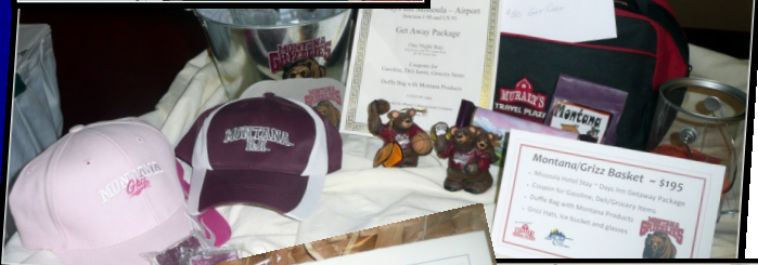
Montana/Griz Basket ~ $195 • 100% Grizzly Day - Don't miss Grizzlies Package • Complete Grizzlies, Day/Evening Show • Duffel Bag with Montana Products • 2000 Hats, Ice Bucket and gloves