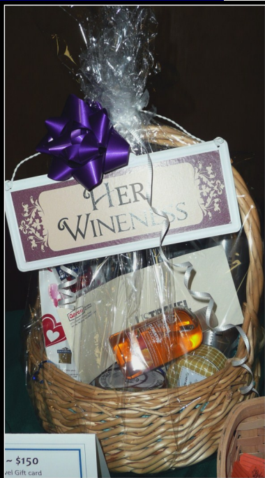
~ $150 el Gift card

A Big thank you to the following companies for donating items/services for our raffle baskets. This year, we raised $1166 (a new record!) and all proceeds benefit the Jane Newton Memorial Scholarship Fund providing financial assistance to local members for education, certification, and meeting registration costs.